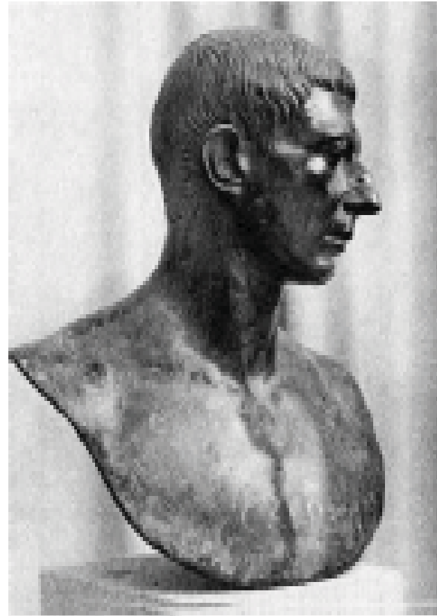
Marcus Porcius Cato

Cato was a prolific author and is regarded as the father of Latin prose. However, the only complete work of his to survive are a loose collection of agricultural instructions and advise, in essence a farmers notebook, about the care of farm estates This famous agricultural manual De agri cultura (De re rustica) is the earliest extant specimen of a treatise in Latin prose. It consists of a collection of disjointed notes and does not compare with the finished prose of Varro or the methodical treatise of Columella. He writes of the practical aspects of crop and livestock farming, the care of estates, profits, slaves, the duties of masters, female housekeepers, and overseers (see READING 19-2 ). Precise directions are given for the construction of olive presses. He writes extensively of cabbage. Although he admonishes his overseers to be sure that servants are well provided for and do not suffer from cold or hunger but advises less food when slaves are sick and is stingy: