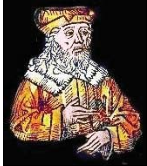
Marcus Terentius Varro

Virgil is quite prescient in his thoughts of selection in cattle breeding.