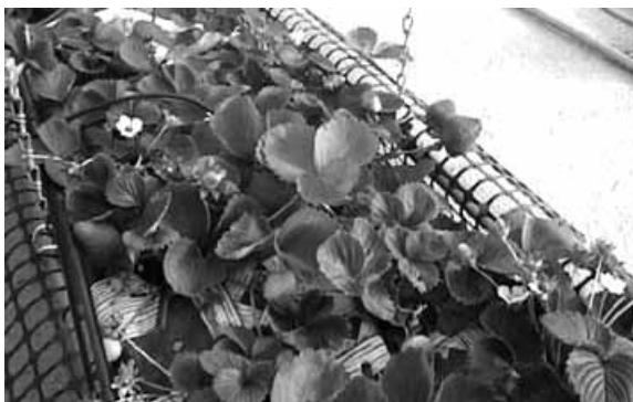
Fig. 3. ‘Sweet Charlie’ is a short day strawberry under evaluation for early winter greenhouse forcing in the program’s new polycarbonate greenhouse at CRS.