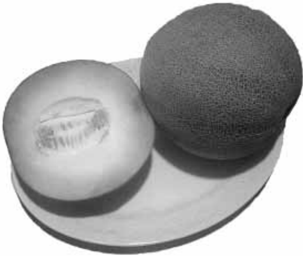
Fig. 1. ‘Emerald Jewel’ is a muskmelon with green flesh and green netted exterior with excellent flavor and handling characteristics.

In early 1999, we will be aggressively seeking the support of the state legislature. North Carolina is the only one of the 46 states covered by the landmark $206 billion settlement (Nov. 1998) to specifically earmark money to help out tobacco-dependent communities. North Carolina will receive $160 million to $190 million annually over the next 25 years. Half of this amount will go to the foundation set up to assist tobacco communities. This new foundation can help us defray the considerable research expense of developing grower and market-ready specialty crops.