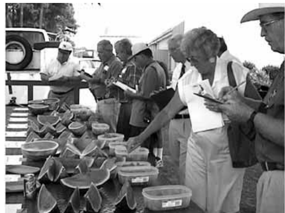
Fig. 4. Seedless watermelon consumer evaluations at Specialty Crops Field Day. The test marketing for specialty melons focuses on a combination of consumer preference surveys, supermarket buyer, foodservice and restaurant evaluations, and market and supply data from various shipping points.